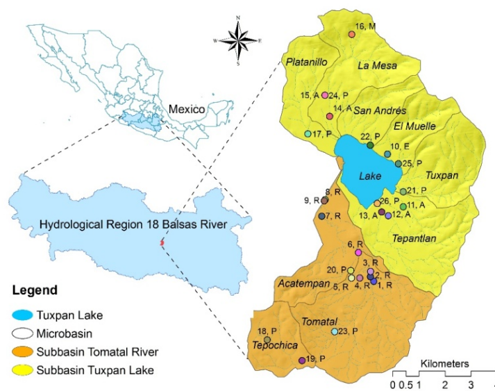
Fig. 1 Location of sampling points in the watershed.

temperature in the coldest month over 18°C and mean annual temperature between 18 and 22°C; warm in the summer; humid or subhumid with summer showers. Intermediate between hot and warm (semi-hot). Lake Tuxpan is surrounded by limestone/dolomite hills and land with slightly to moderately steep slopes. Standing out in the topography are the hills located towards the NE, N and SW with a height of 1,731 masl. The low-flow streams, together with El Tomatal River, conduct stormwater into the lake. In addition to limestone-dolomite, there is alluvium, polymictic conglomerate-sandstone, and lithite-sandstone from the Lower Cretacic, Paleogene Tertiary, and Quaternary periods. A quite diverse array of soil types can be observed, with predominance of ortic and calcic Luvisol (31.24%), calcareous Regosol (19.70%), and calcic and chromic Cambisol (17.97%). These three types of soil occupy 69% of the watershed. There is also Vertisol, Kastanozem, Phaeozem, Rendzina, and Lithosol. There is predominance of lower caducifolia forest (35.85%), followed by induced grazeland (29.88%), and rainfed agriculture (19.28%), which occupy 80.94% of the area. The rest is occupied by oak tree forest, grassland, nopal (cactus leaf) plantations, palm plantations, two-season agriculture, and hydrophytes (Fig. 1) [4].